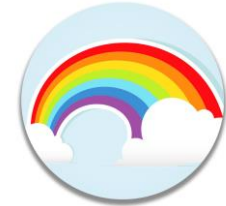
にじ Toddler 2 Class