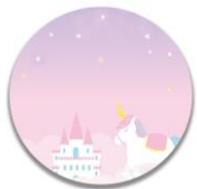
ゆめ Pre-kinder Class