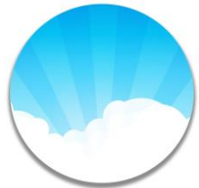
そら Baby Class